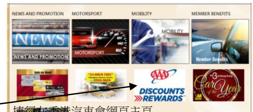
捷徑在香港汽車會網頁主頁 Shortcut on HKAA's Homepage

香港汽車會會員已自動參與由美國、加拿大及歐洲汽車會聯手提供的“出示會員咭享折扣優惠及獎賞”的計劃，在全球超過 55,000 的指定商戶獨享超級折扣優惠。詳情請瀏覽 http://www.aaa.com/PPInternational/International.html 。本會代碼是 800。