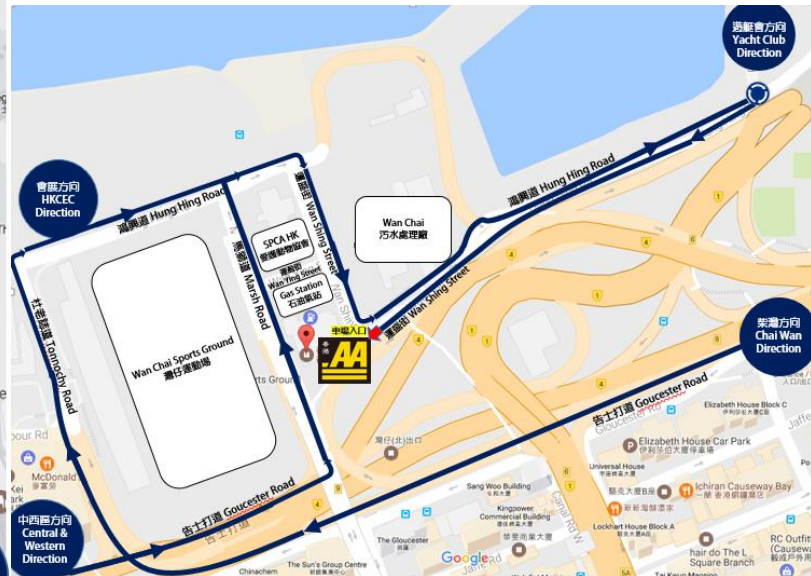
香港灣仔馬師道新填地 Marsh Road, Wanchai, Hong Kong