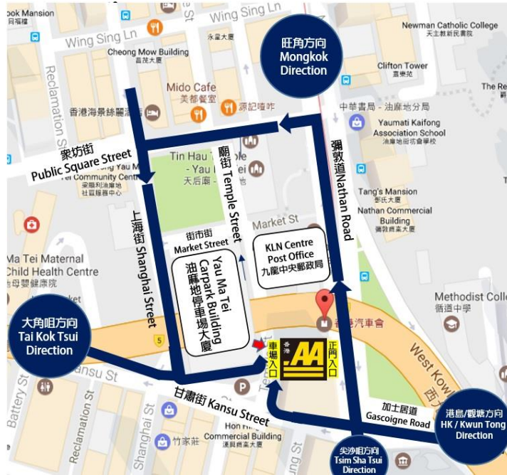
九龍彌敦道 391 391 Nathan Road, Kowloon, HK